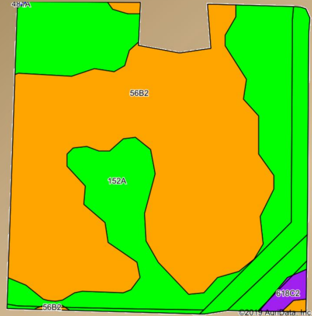
Aerial Photo & Soils data provided by AgriData, Inc. Lines drawn are estimates.