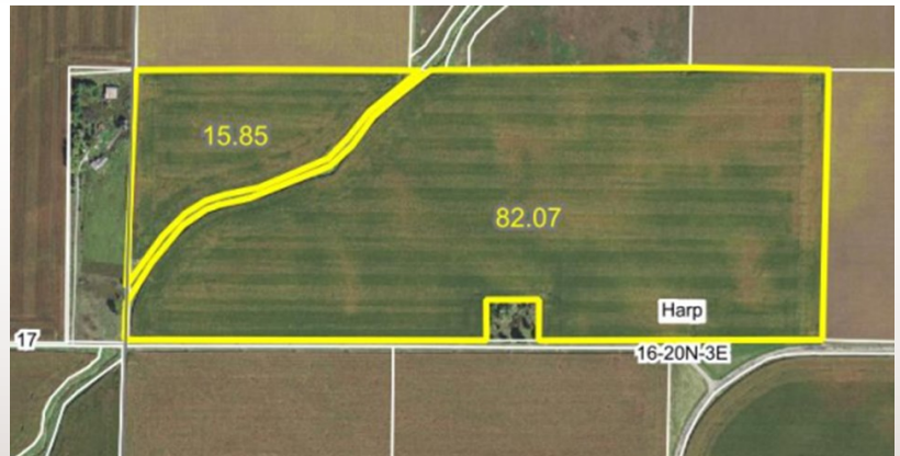
FSA & Soils data provided by AgriData, Inc. Lines drawn are estimates.