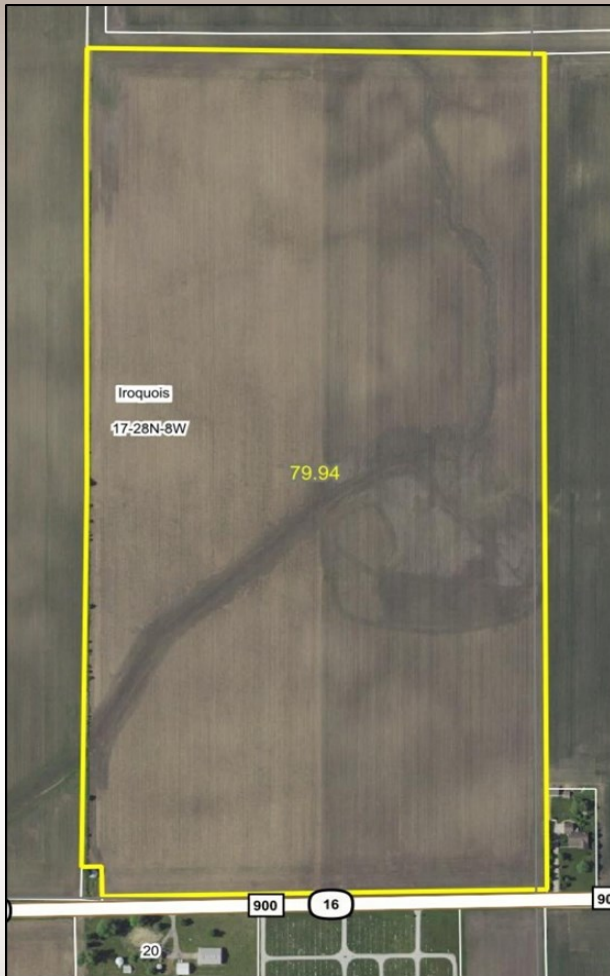
FSA & Soils data provided by AgriData, Inc. Lines drawn are estimates.