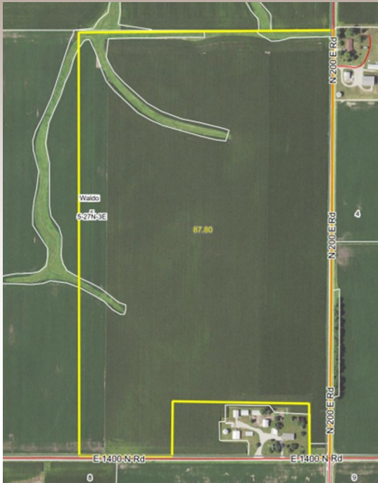
Aerial & Soils data provided by AgriData, Inc. Lines drawn are estimates.